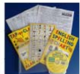
S-97 ENGLISH SPELLING CHART PACK (Training Pack)