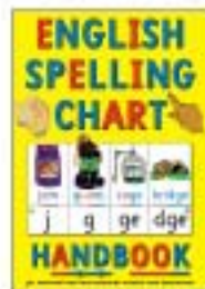
S-76 ENGLISH SPELLING CHART HANDBOOK