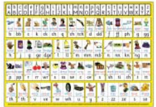
S-46 ENGLISH SPELLING CHART A4