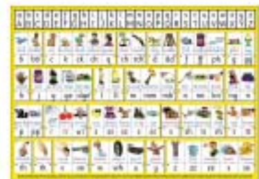
S-75 ENGLISH SPELLING CHART A5