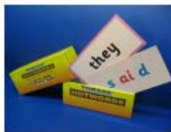
T-52 HOTWORDS CARDS

S-20 SOUND IT OUT, S-12 SING-A-LONG, S-15 THRASS-IT WINDOW