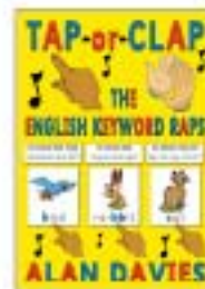
S-87 TAP OR CLAP THE ENGLISH KEYWORD RAPS