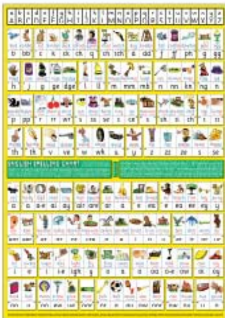
ENGLISH SPELLING CHART (CLASS WALLCHARTS)