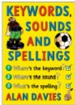
S-98 KEYWORDS, SOUNDS AND SPELLINGS BOOK

by teaching them the building blocks in 120 keywords