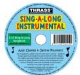
S-24 SING-A-LONG CDs (2 DISCS)