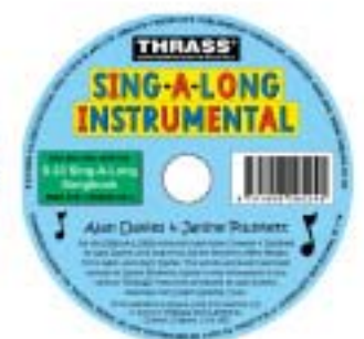
S-24 SING-A-LONG CDs (2 DISCS)