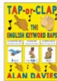
S-87 TAP OR CLAP THE ENGLISH KEYWORD RAPS