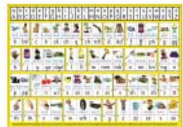
S-75 ENGLISH SPELLING CHART A5