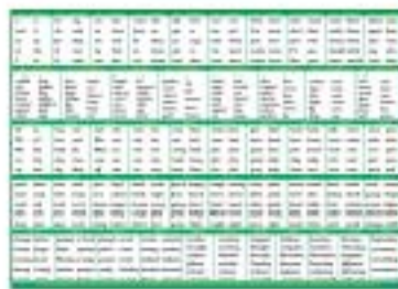
S-94 ENGLISH SPELLING 500 CHART