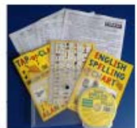
S-97 ENGLISH SPELLING CHART PACK (Training Pack)