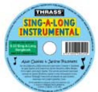
S-24 SING-A-LONG CDs (2 DISCS)