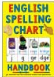
S-76 ENGLISH SPELLING CHART HANDBOOK