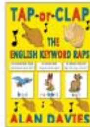
S-87 TAP OR CLAP THE ENGLISH KEYWORD RAPS