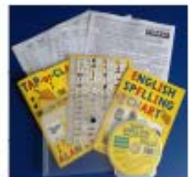
S-97 ENGLISH SPELLING CHART PACK (Training Pack)