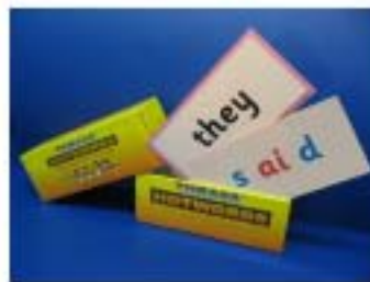
T-52 HOTWORDS CARDS

S-20 SOUND IT OUT, S-12 SING-A-LONG, S-15 THRASS-IT WINDOW