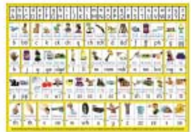
S-75 ENGLISH SPELLING CHART A5