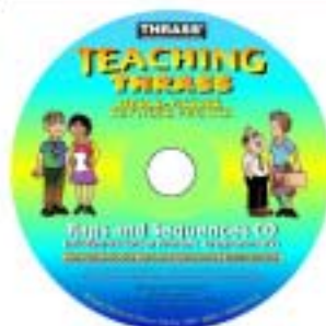
T-51 RAPS AND SEQUENCES CD