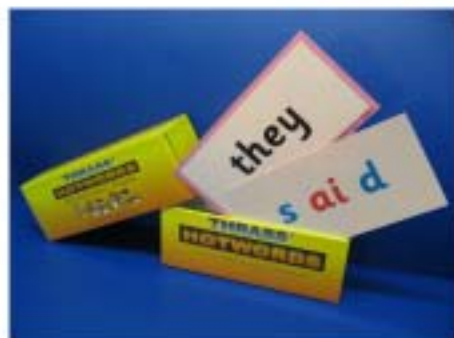
T-52 HOTWORDS CARDS

PC SOFTWARE S-12 SING-A-LONG S-20 SOUND IT OUT S-15 THRASS-IT WINDOW