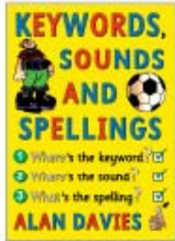
S-98 KEYWORDS, SOUNDS AND SPELLINGS BOOK