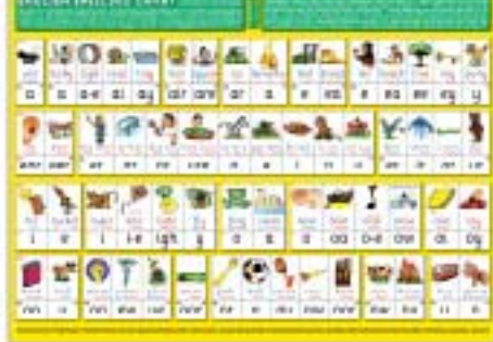
ENGLISH SPELLING CHART (CLASS WALLCHARTS)

LARGE: S-49 size A0 MEDIUM: S-48 size A1