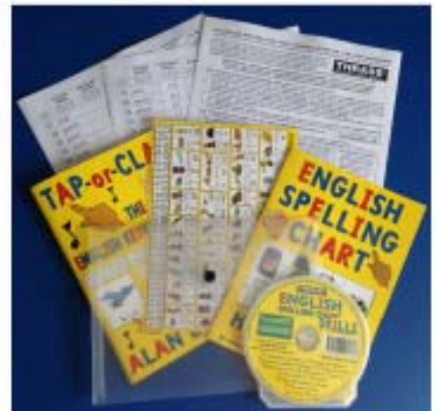
S-97 ENGLISH SPELLING CHART PACK

PC SOFTWARE S-12 SING-A-LONG S-20 SOUND IT OUT S-15 THRASS-IT WINDOW