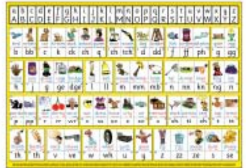
S-46 ENGLISH SPELLING CHART A4