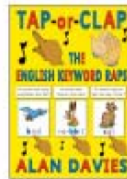
S-87 TAP OR CLAP THE ENGLISH KEYWORD RAPS