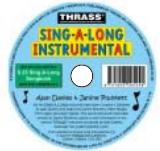
S-24 SING-A-LONG CD (2 DISCS)