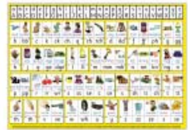
S-75 ENGLISH SPELLING CHART A5